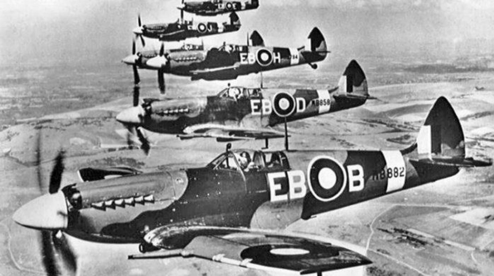
Spitfires were used for bombing Germany during WW2. They are British single-seat fighter aircraft used by the Royal Air Force.