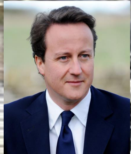
David Cameron (Former PM)

The memorial was vandalised after the Conservative party gained power after the election in May 2015. Red graffiti paint was sprayed over parts of the Monument to the Women of WWII. David Cameron (PM at the time) and No.10 Downing Street called the act “despicable”. 17 people were arrested outside Whitehall.