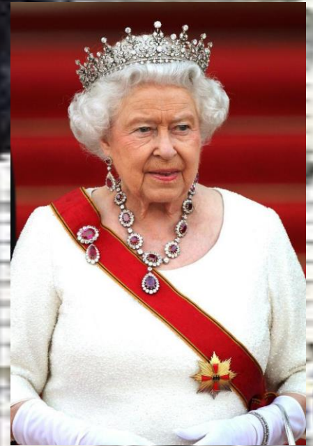
HRM The Queen